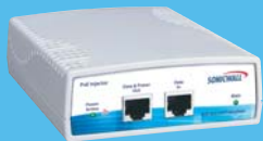
PoE Injector SonicWALL PoE Injector (N. America) 01-SSC-5531 SonicWALL PoE Injector (International including Japan) 01-SSC-5532