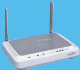
SonicPoint SonicPoint (N. America) 01-SSC-5522 SonicPoint (International) 01-SSC-5523 SonicPoint (Japan) 01-SSC-5524